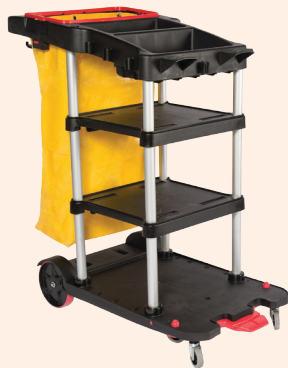
Dock 'n Lock Janitor Cart