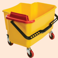
Microfiber Charging Bucket