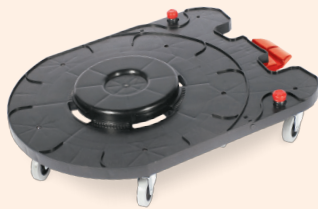
Dock 'n Lock Dolly

Choose Dock 'n Lock Janitor Cart or Dolly.